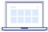
Ultimaker Digital Factory