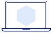
Ultimaker Cura Enterprise