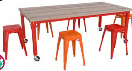
36Wx72Dx26H with Red Legs Red/Orange 18" Stools

3" Heavy Duty All Locking & Swivel Casters