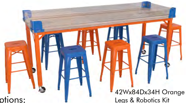
42Wx84Dx34H Orange Legs & Robotics Kit 24" Orange & Royal Blue Stools