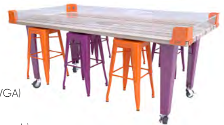
NEW! Robotics Bumper Kit