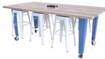
NEW! Colored Leg Options