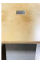
Birch Plywood 1.5" Birch Hardwood 24 Layers Of Birch Veneer High Grade Clear Face UV Coated/Anti-Microbial Stain & Chemical Resistant