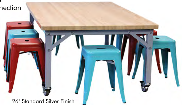
26" Standard Silver Finish 18" Red & Aqua Stools

Quickly and easily attaches to any ED Table, Idea Island or select Brainstorm Workbenches. Metal corners slide onto corners and polycarbonate sides nest into corners and attach by magnets. Two side clamps also attach to 72L & 84L sides of table for additional support.