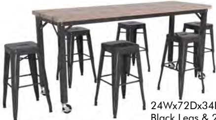
24Wx72Dx34H Black Legs & 24" Black Stools