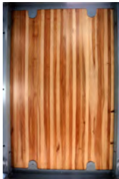
Full Square Welded Frame (Underneath View)