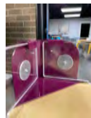
Corner Support & Magnet Connection