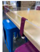
Side Support Clamp