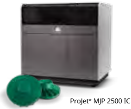
ProJet® MJP 2500 IC

Building productivity and new manufacturing efficiencies with tool-less 3D printed casting pattern production from 3D Systems