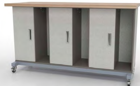
42" Cubby pods with optional doors. Top shown mounted for one side seating. Shown in Folkstone Hex