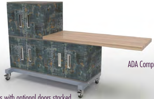
34" Shelf pods with optional doors stacked with 26" pods. Off-set mounted 50" top. Shown in Paint Scrape Steel