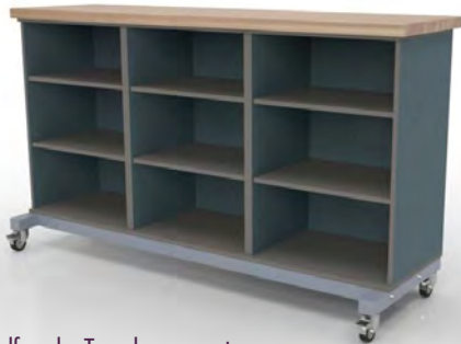
42" Open face shelf pods. Top shown center mounted. Shown in Wintersky