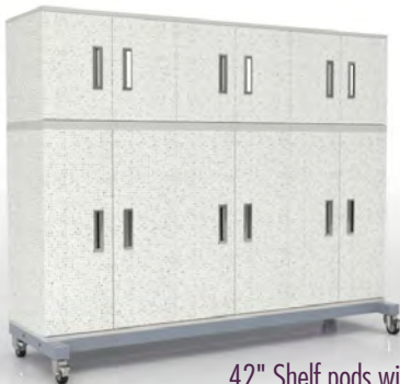
42" Shelf pods with optional door stacked with 26" Pods. Shown in Happy Dots