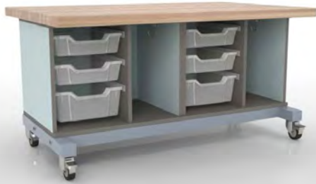
26" Open face cubby pods. Center mounted top. Shown in Liquid Glass