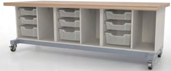
26" Open face cubby pods. One side seating mounted top. Shown in Happy Dots