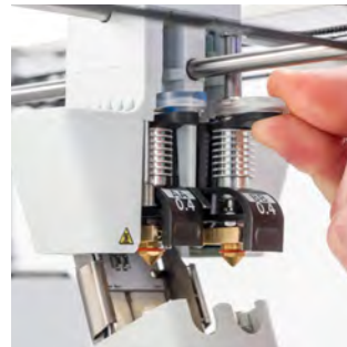
Print cores AA and BB Quick-swap nozzles for build and water-soluble support materials