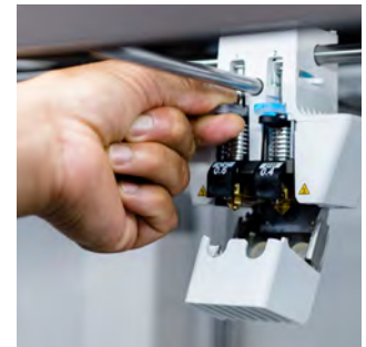
Print core CC Ruby-tipped for printing abrasive composites