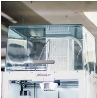
Air Manager EPA filter removes up to 95% of UFPs