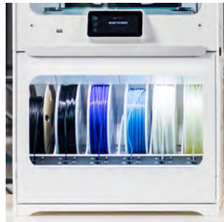
Material Station Simplify and automate material handling