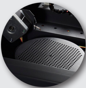
Built-in HEPA Air Filtration System