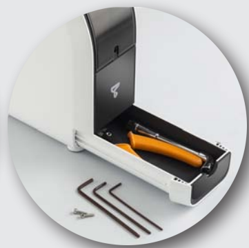
Built-in Toolbox Tools included!

Ideal for schools, makerspaces, libraries and multi-unit installations!