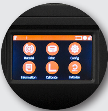
Color Touch Screen Control