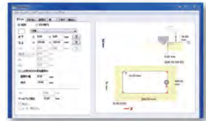
ClickMILL™ is a simple milling solution for surfacing, drilling holes and pocketing without using 3D CAD (Computer Aided Design) software.