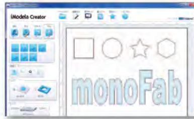
iMODELA Creator is software for processing 2D data such as text and graphics.