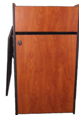
BACK Audience/classroom side