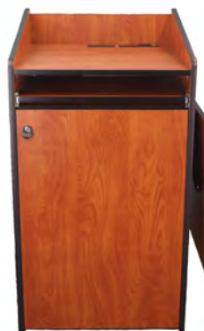
FRONT Instructors side