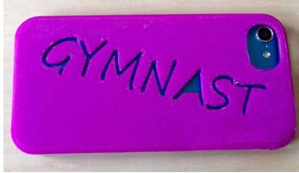
Personalized Phone Case