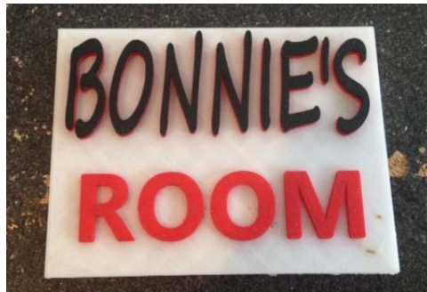
Vertical Name Plate