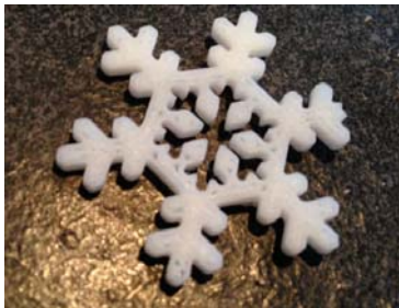
Printing a Multi-Piece Model