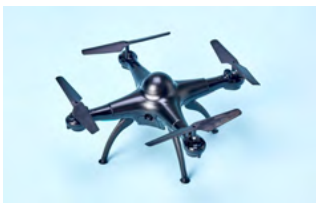
An aerodynamic drone casing