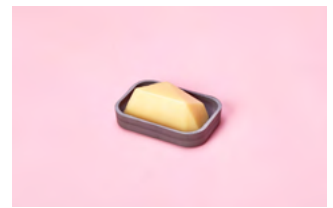
Geometric soap and the dish for it to live in