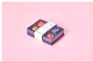
A box of chocolates and packaging