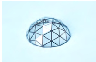
Mock up glasswork for a geodesic dome