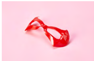
A set of coloured superhero masks