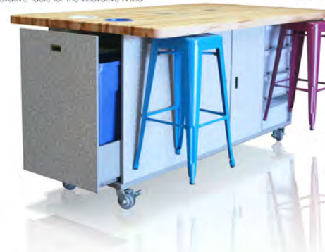
The "Ed" Table An Innovative Table for the Innovative Mind

IIDA EDspaces INNOVATION AWARDS 2017 WINNER