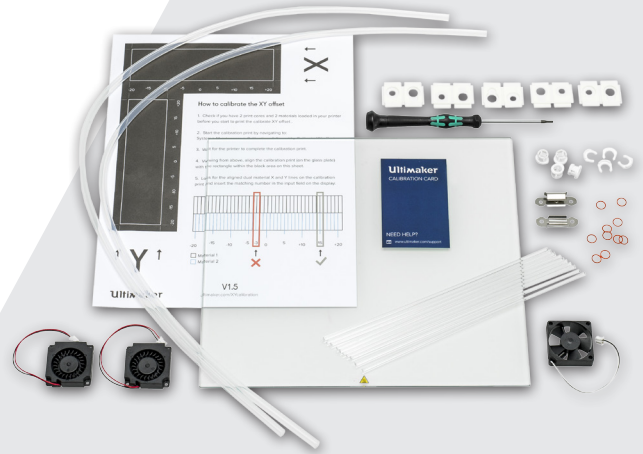
Ultimaker 2+ Maintenance Kit Included!

Available with the Ultimaker 2+ and Ultimaker 3 (including Extended models), you get an extra 12 months of warranty for your 3D printer with all repairs and shipping covered, plus an Ultimaker Maintenance Kit containing tools and spare parts for routine care.