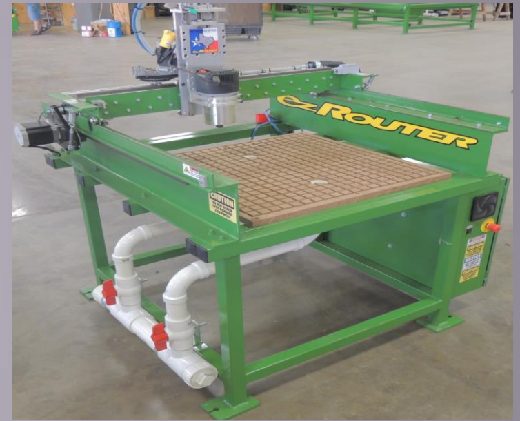
Shown above: Left - Vacuum T-Slot. Right - Phenolic Vacuum