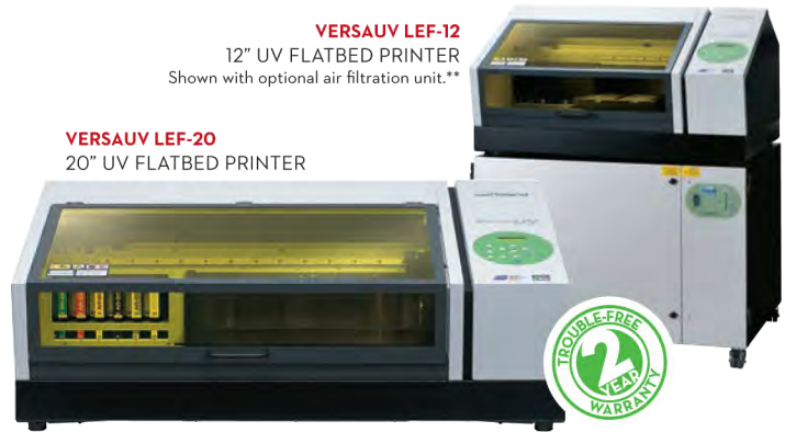
VERSAUV LEF-12 12" UV FLATBED PRINTER Shown with optional air filtration unit.**