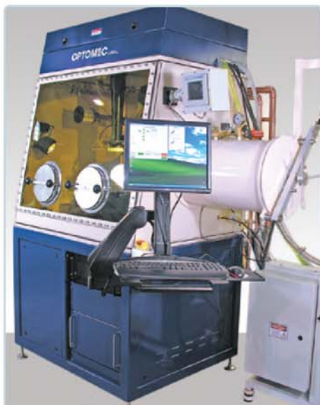
LENS MR-7 System

The LENS MR-7 system offers a 300mm cubed work envelope, making it ideal for the manufacture or repair of smaller components. LENS systems use energy from a high-power Fiber Laser to build up structures one layer at a time directly from powder – metals, alloys, ceramics or composites. The two powder feeders allow gradient materials to be made – every layer can have a different chemistry. This enables new materials to be made and analyzed with extraordinary speed. LENS systems are used throughout the entire product lifecycle for applications ranging from rapid alloy development and functional prototyping to rapid manufacturing or repair.