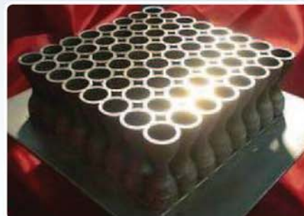
Novel structures created by LENS

LENS systems are used in the repair and rapid manufacturing of metal components in state-of-the-art materials such as titanium, stainless steel, and Inconel®. Use the LENS MR-7 System to rapidly create materials of exceptional quality.